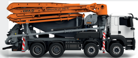
Placing boom MK28L-5"